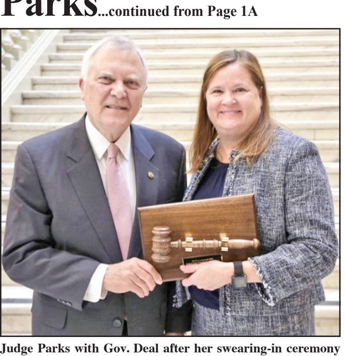
on Aug. 14 in Atlanta.

forward to a long career serving the residents of Union, Towns, White and Lumpkin counties.